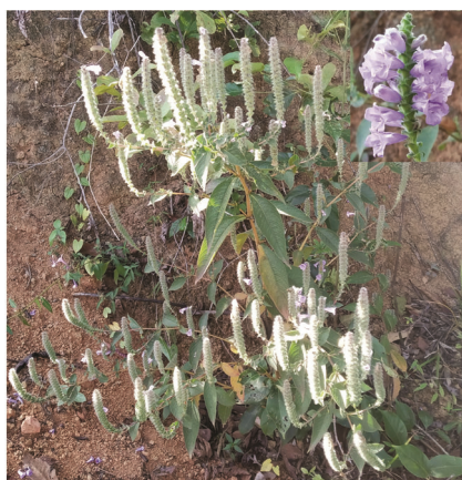
Figure 1. Strobilanthes auriculata Nees in natural habitat (inset: Inflorescence) at Kaina, Thoubal district, Manipur, India.

Strobilanthes auriculata Nees, commonly known as Eared Leaf Coneflower is a plietesial plant 8 . It is locally known as 'Kumtrukpee' in Manipur. Along the foothills of the Himalayas, S. auriculata was reported from Punjab to Darjeeling but apparently absent further east. It was reported to occur further south in Bihar, then in Meghalaya, Nagaland and Manipur in